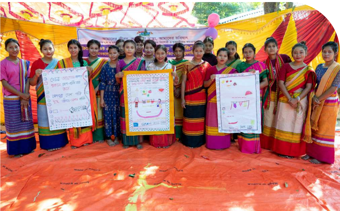
The members of the Montripara Girls Club, Khagrachari showing their poster presentation on menstrual health management

After I got my first period, I lost the freedom I had as a child. Whenever I go out, people always ask questions about where I am going, with whom, and for what. If I get home late, my neighbours gossip about it.