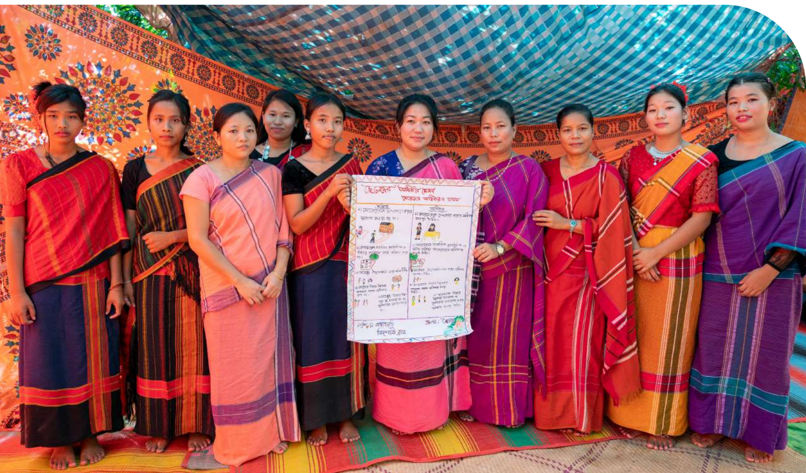
The girls from West Baghaichori Adolescent Girls' Club are showing their poster presentation to the audience

Safety and independence go hand in hand and I hope that people were able to realise this through our poster presentation.