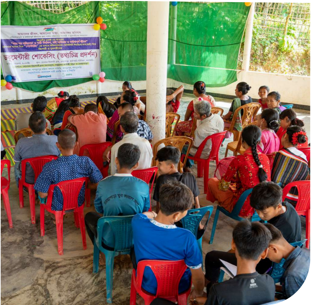
The audience at the poster presentation event organized by the girls of Moanghar Girls Club, Khagrachari

I enjoy wearing dresses but unfortunately, I get taunted on the streets when I do. I would love to go to the bazaar wearing the dresses I like but I end up feeling terrible because the boys there always tease me.