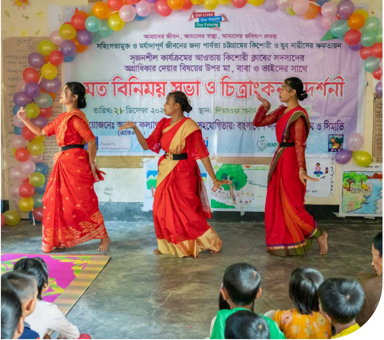
The girls are dancing during the event of poster presentation

After our presentation, I noticed some positive changes. My brother started assisting with household chores traditionally done by women and people listened to what I had to say.