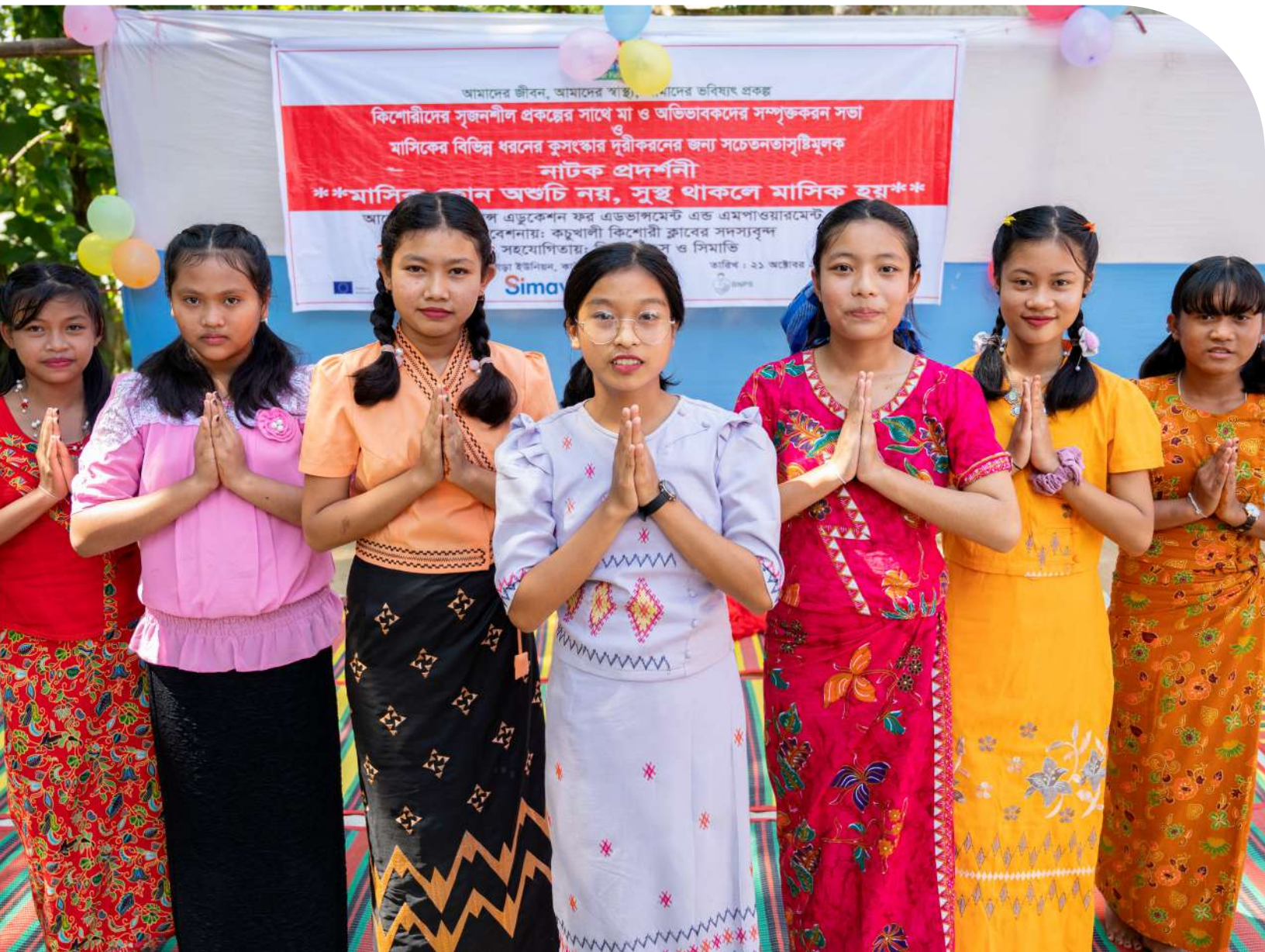
The girls from Kachukhali girls club after the performance

I hope that more people understand that menstruation is normal and that we must be understanding toward those experiencing it.