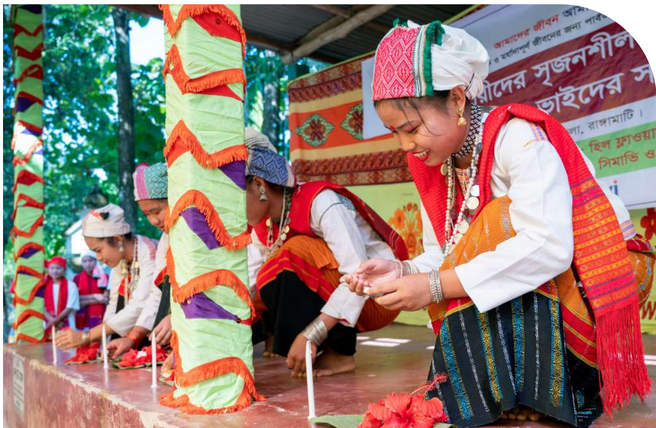
Young girls are lighting candles on the stage