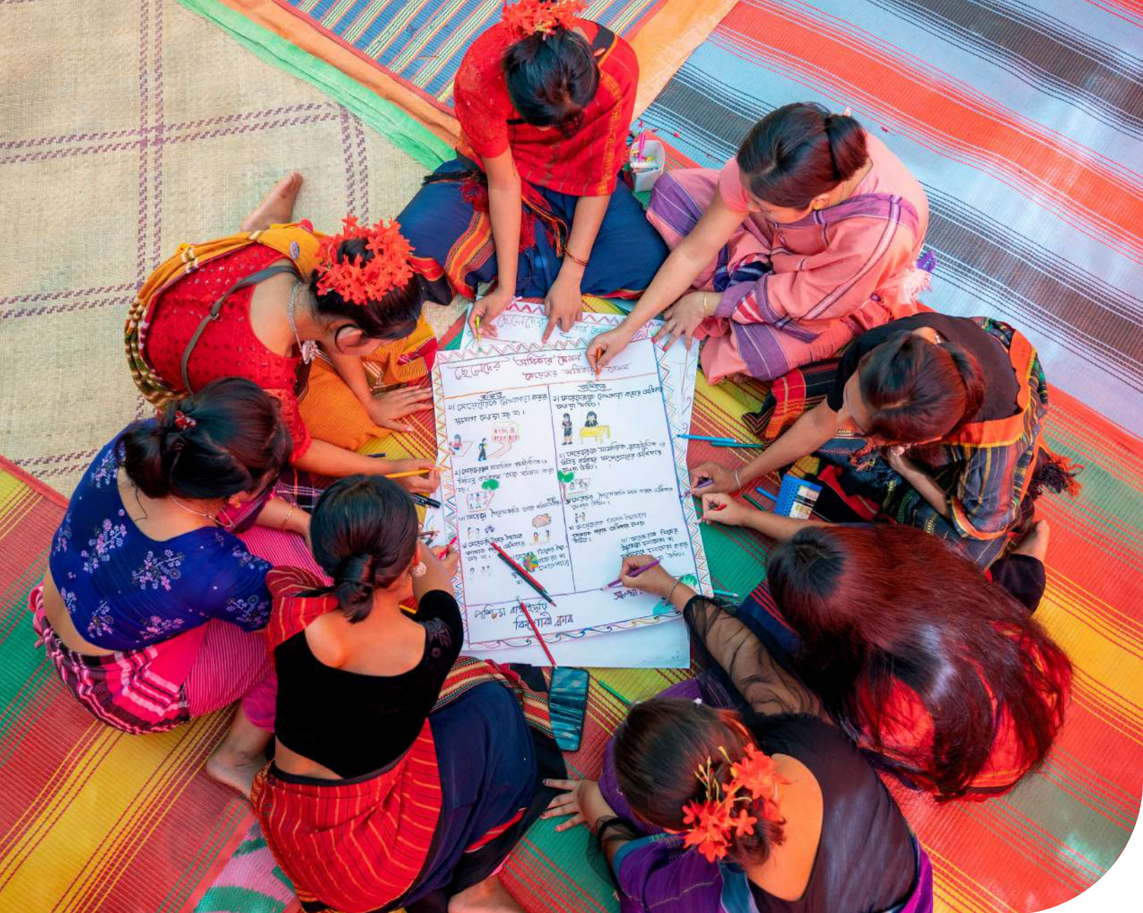
The members of the West Baghaichori Adolescent Girls' club almost finished their poster presentation

In my community, girls grow up, get married, and have to listen to their husbands. They say this is for our safety but I disagree. I want to be independent and take care of my parents instead.