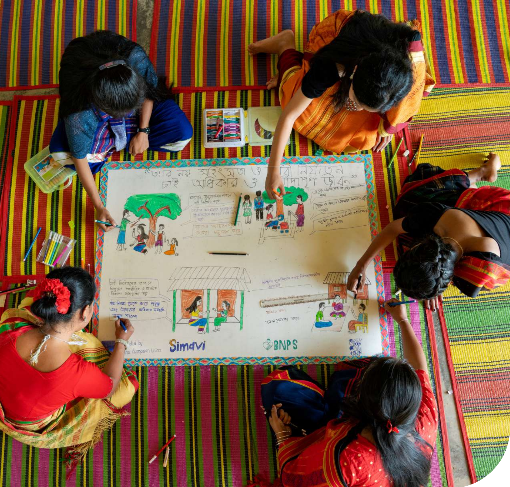
The adolescent girls from Moanghar Girls Club, Khagrachari are working on their poster presentation

My goal was to raise awareness about gender-based violence. I showed the posters to the parents in every family in my area, hoping this would convince them to provide both their sons and their daughters with equal opportunities.