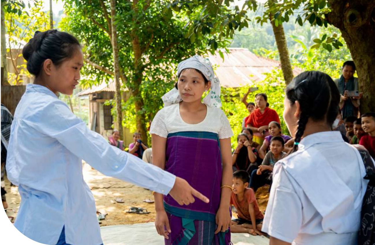
The adolescent girls portraying different characters in their street play on changing gender roles

While I have all these hopes and dreams, I find it difficult to get through my day because of the harassment I face. Commuting to and from college is a major issue in my area. Whenever I take public transport, boys sit uncomfortably close to me. Once, while I was out shopping, an old man approached me. He asked me for my WhatsApp number but I refused to give it to him.