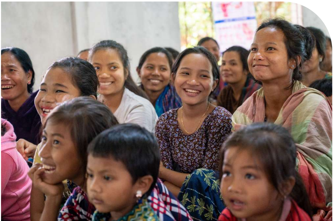
The audience watching the short drama on the negative impact of child marriage

Educating girls is more important than child marriage because when educated, a girl can study and support herself no matter what happens in her future. We made it a point to inform parents that they should prioritise their child's education. I am proud of the project's outcome and hope this conversation continues in the future.