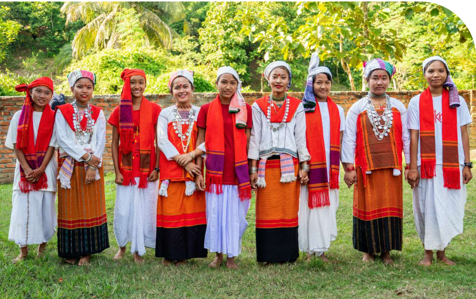
Young actors at the end of the drama about the negative impact of early marriage

My fellow club members and I put together a play with the slogan "Keep your emotions under control. Stay away from child marriage." The play spoke about how schoolgirls fall in love with boys and run away from home to get married. This could be very dangerous for young girls, especially if they do not have the support and protection of their families. They also experience health issues if they get pregnant while they are too young. I now know a lot about reproductive health, child marriage, and other related issues, and want to share this knowledge with others. I have also realised my value and want to be myself without any societal pressures holding me back.