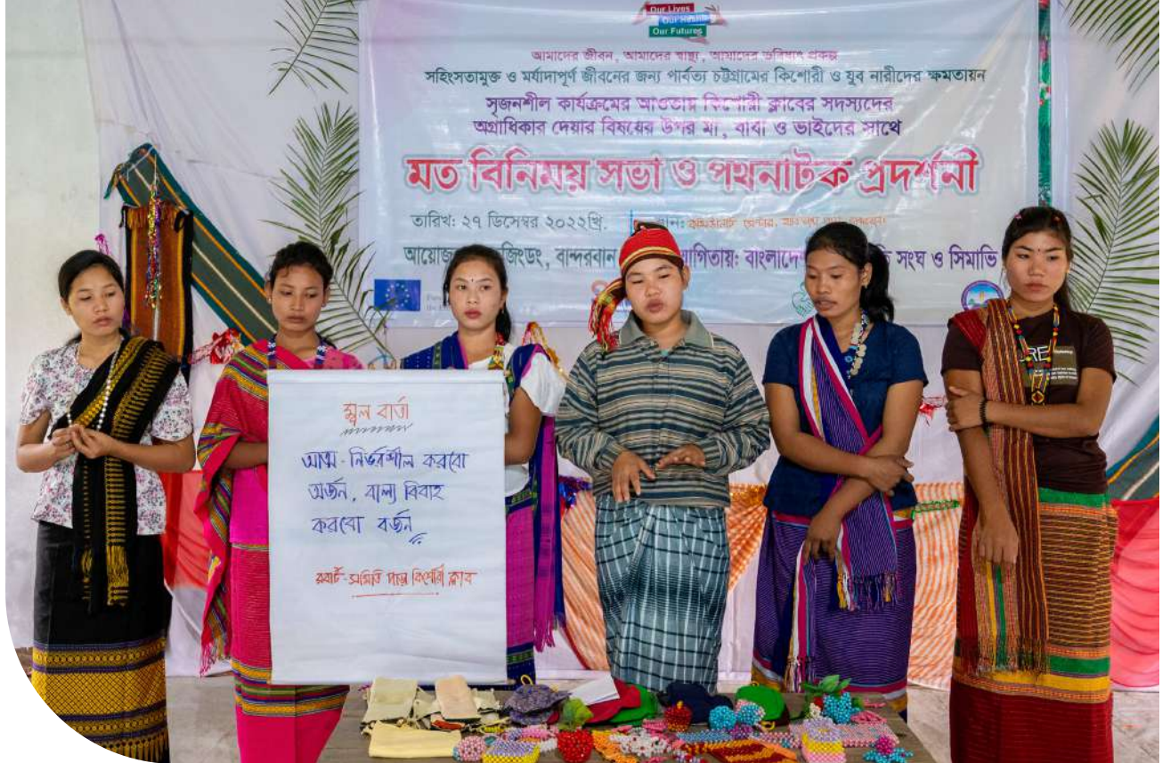
The performers at the end of their short drama on the negative impact of child marriage

Educating girls is more important than child marriage because when educated, a girl can study and support herself no matter what happens in her future. We made it a point to inform parents that they should prioritise their child's education. I am proud of the project's outcome and hope this conversation continues in the future.