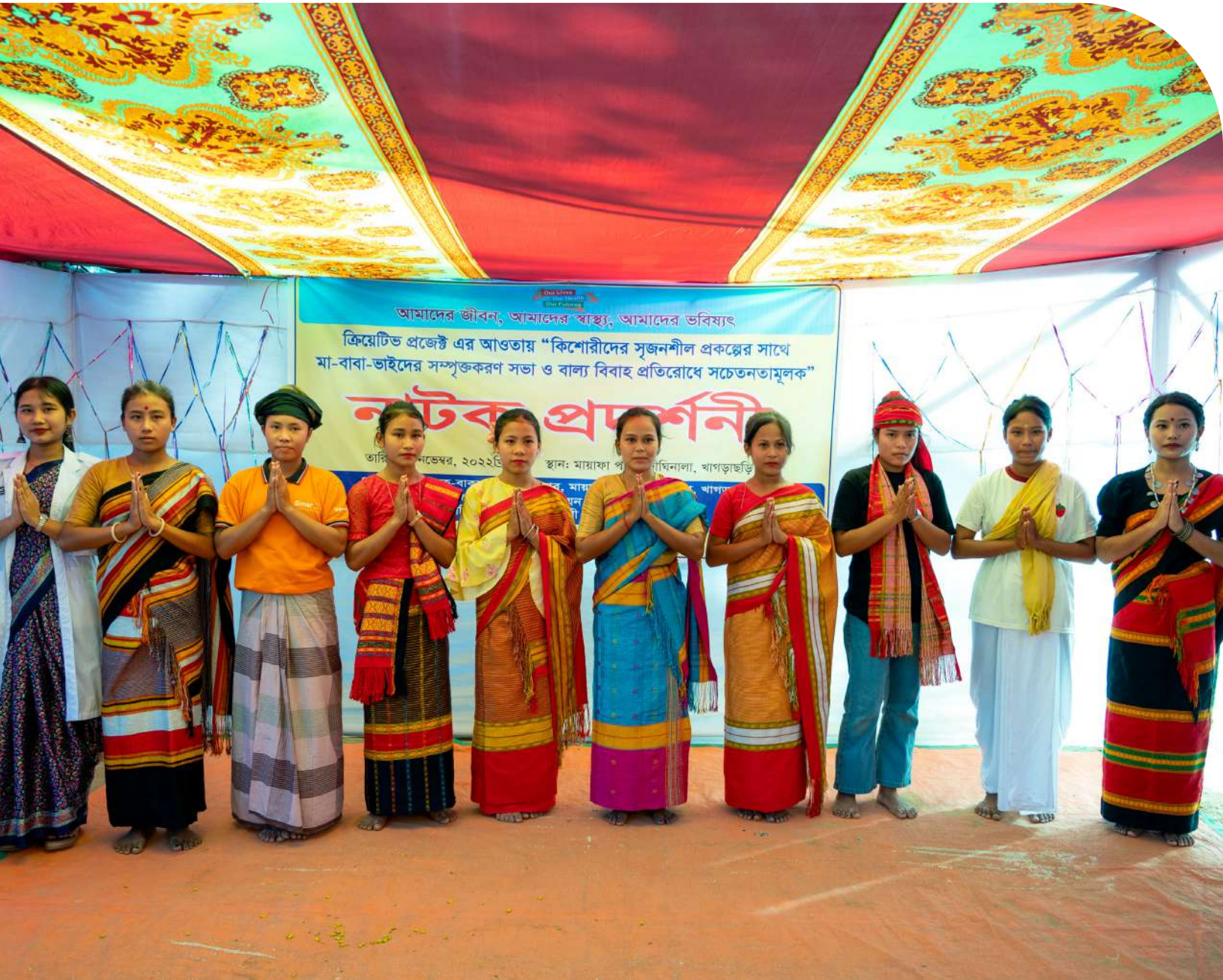
The adolescent girls from Kokbaksha Girls Club, Khagrachari during the end of their performance

I am glad I was able to educate some people in my community through the play. I hope to share this knowledge with our friends and neighbours to prevent child marriage.