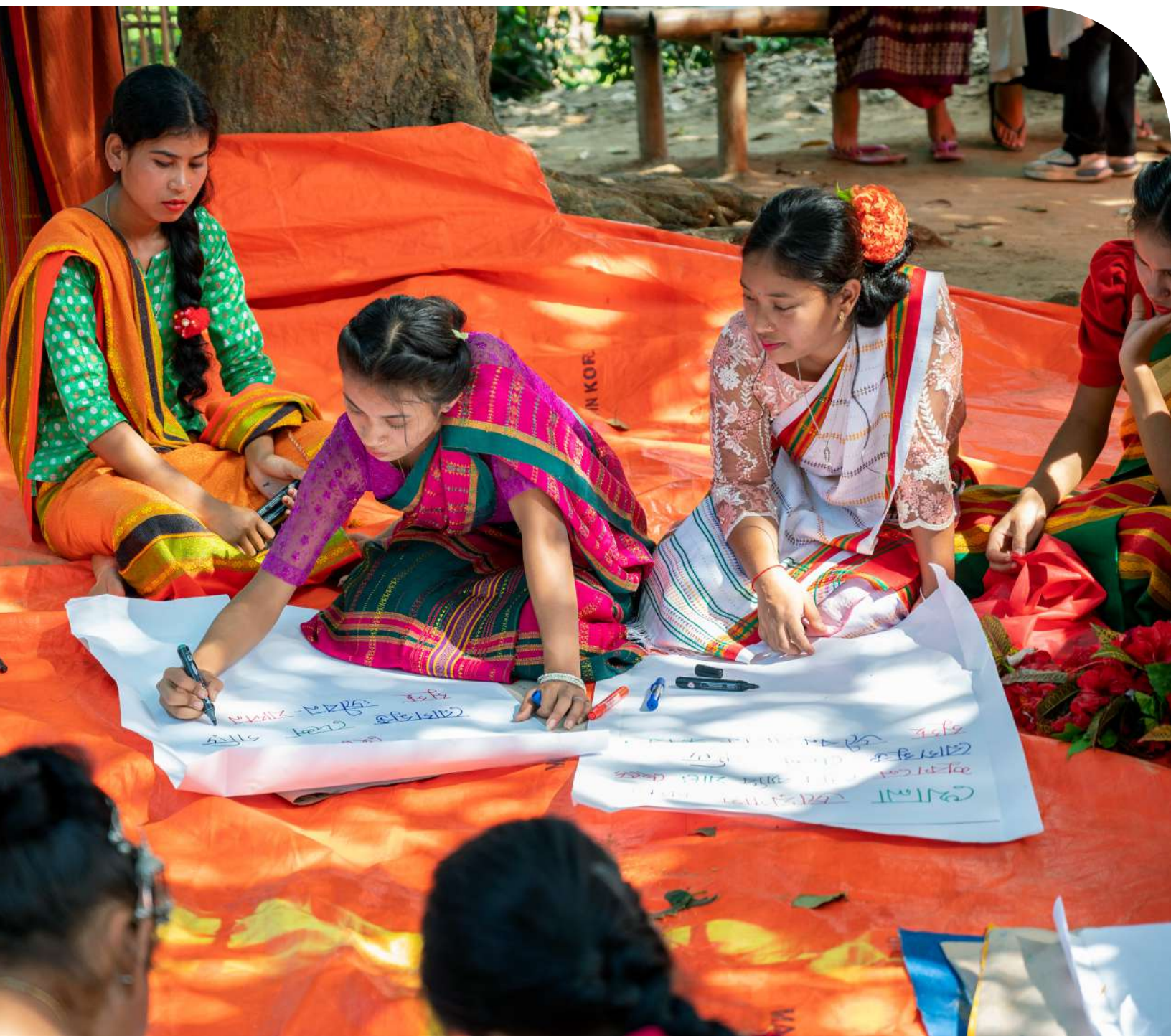
The adolescent girls from Montripara Girls Club, Khagrachari are preparing their poster presentation

I will continue raising my voice about this subject until everyone accepts that menstruation is healthy and normal.