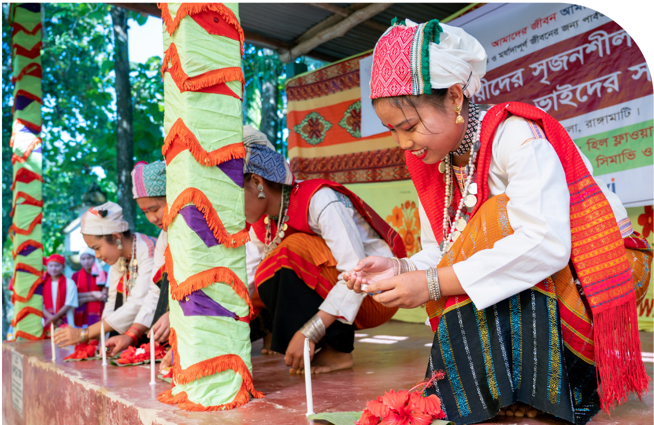
Young girls are lighting candles on the stage