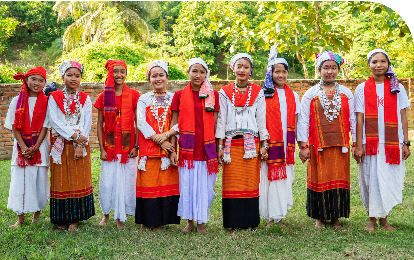
Young actors at the end of the drama about the negative impact of early marriage

My fellow club members and I put together a play with the slogan "Keep your emotions under control. Stay away from child marriage." The play spoke about how schoolgirls fall in love with boys and run away from home to get married. This could be very dangerous for young girls, especially if they do not have the support and protection of their families. They also experience health issues if they get pregnant while they are too young. I now know a lot about reproductive health, child marriage, and other related issues, and want to share this knowledge with others. I have also realised my value and want to be myself without any societal pressures holding me back.