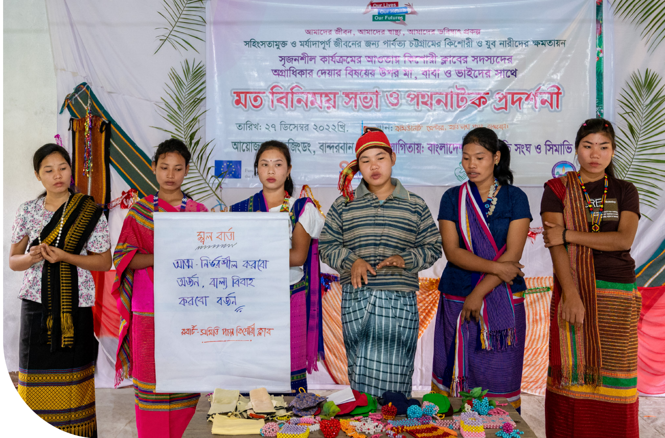
The performers at the end of their short drama on the negative impact of child marriage

Educating girls is more important than child marriage because when educated, a girl can study and support herself no matter what happens in her future. We made it a point to inform parents that they should prioritise their child’s education. I am proud of the project’s outcome and hope this conversation continues in the future.