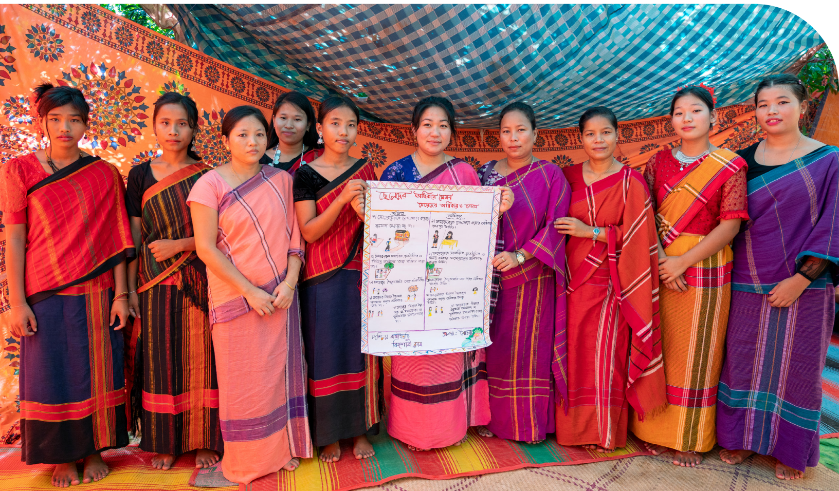
The girls from West Baghaichori Adolescent Girls' Club are showing their poster presentation to the audience

Safety and independence go hand in hand and I hope that people were able to realise this through our poster presentation.