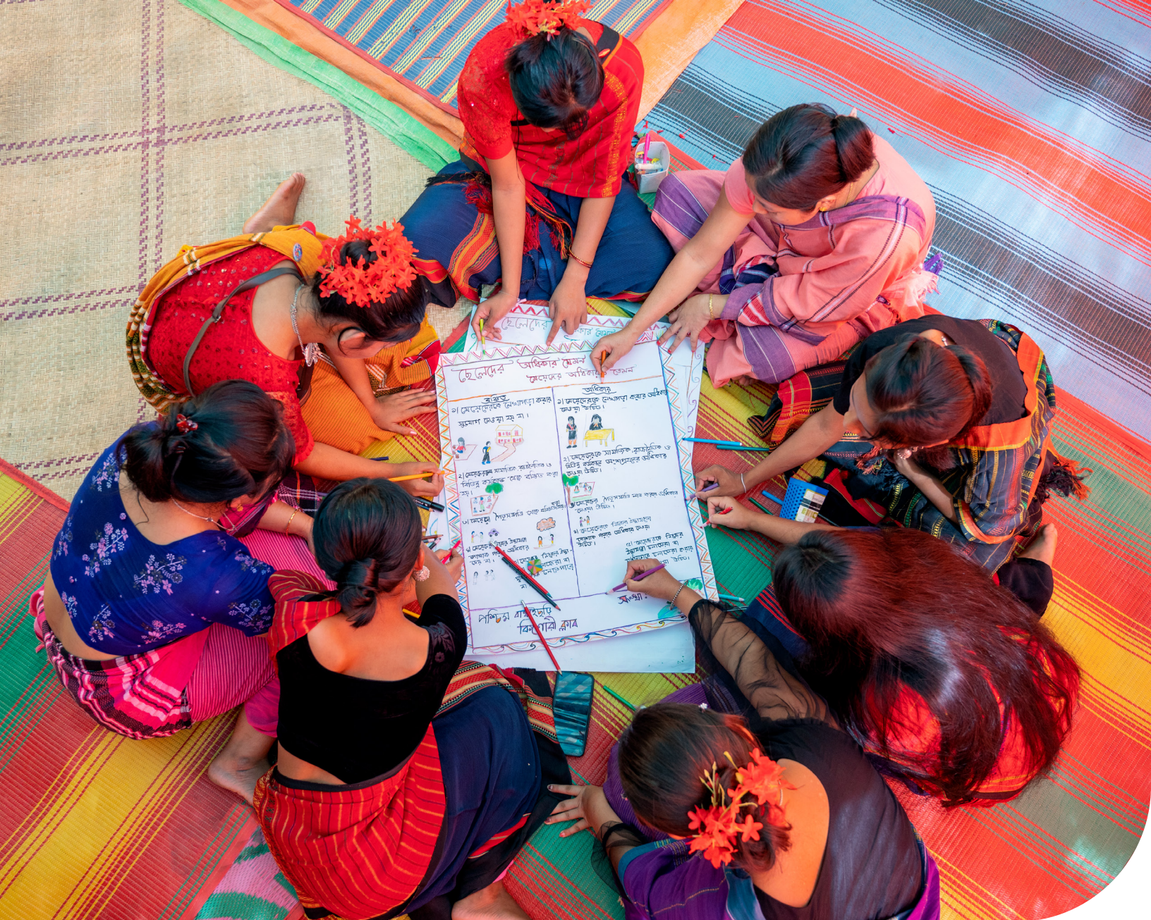
The members of the West Baghaichori Adolescent Girls' club almost finished their poster presentation

In my community, girls grow up, get married, and have to listen to their husbands. They say this is for our safety but I disagree. I want to be independent and take care of my parents instead.