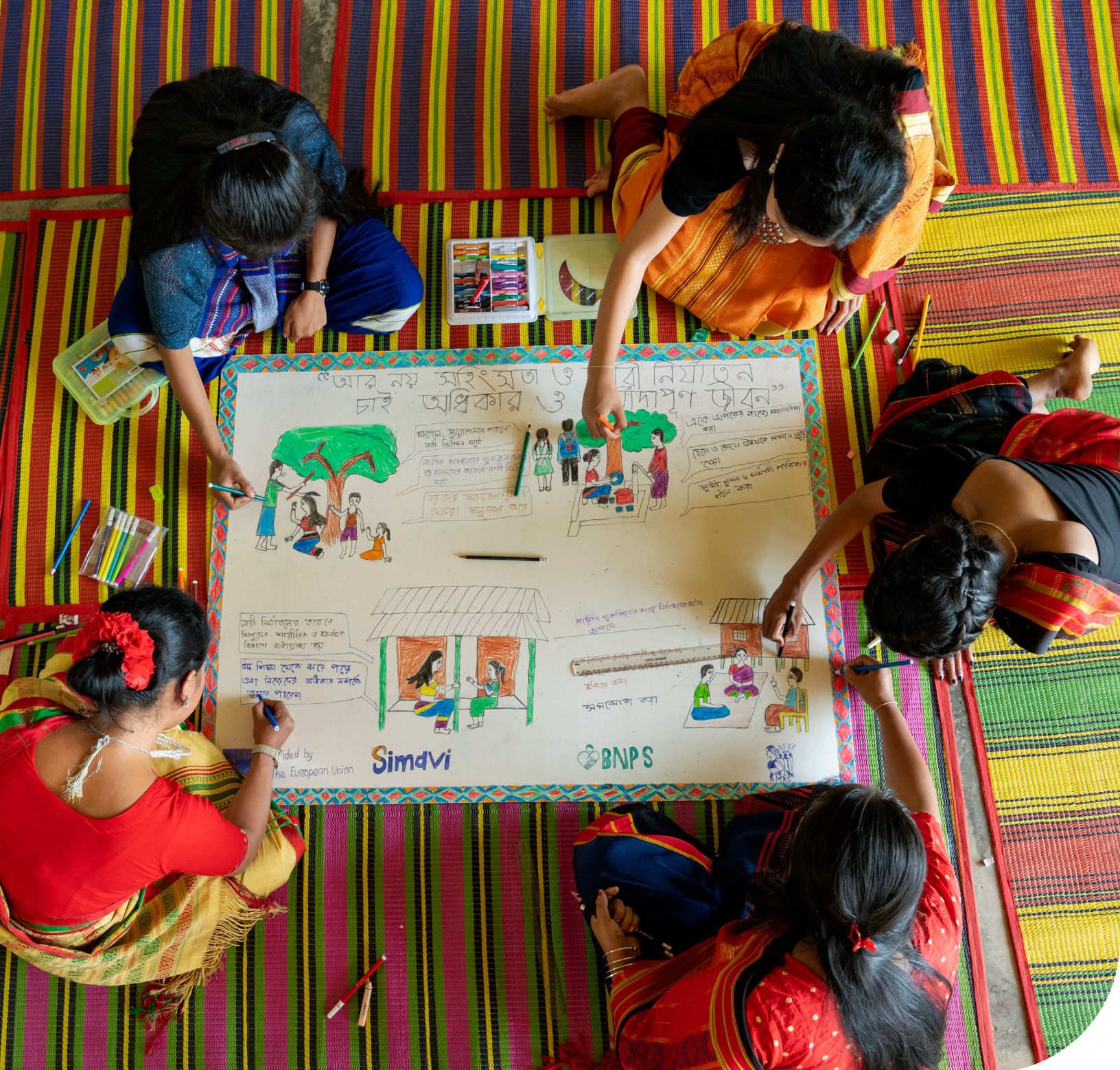
The adolescent girls from Moanghar Girls Club, Khagrachari are working on their poster presentation

My goal was to raise awareness about gender-based violence. I showed the posters to the parents in every family in my area, hoping this would convince them to provide both their sons and their daughters with equal opportunities.