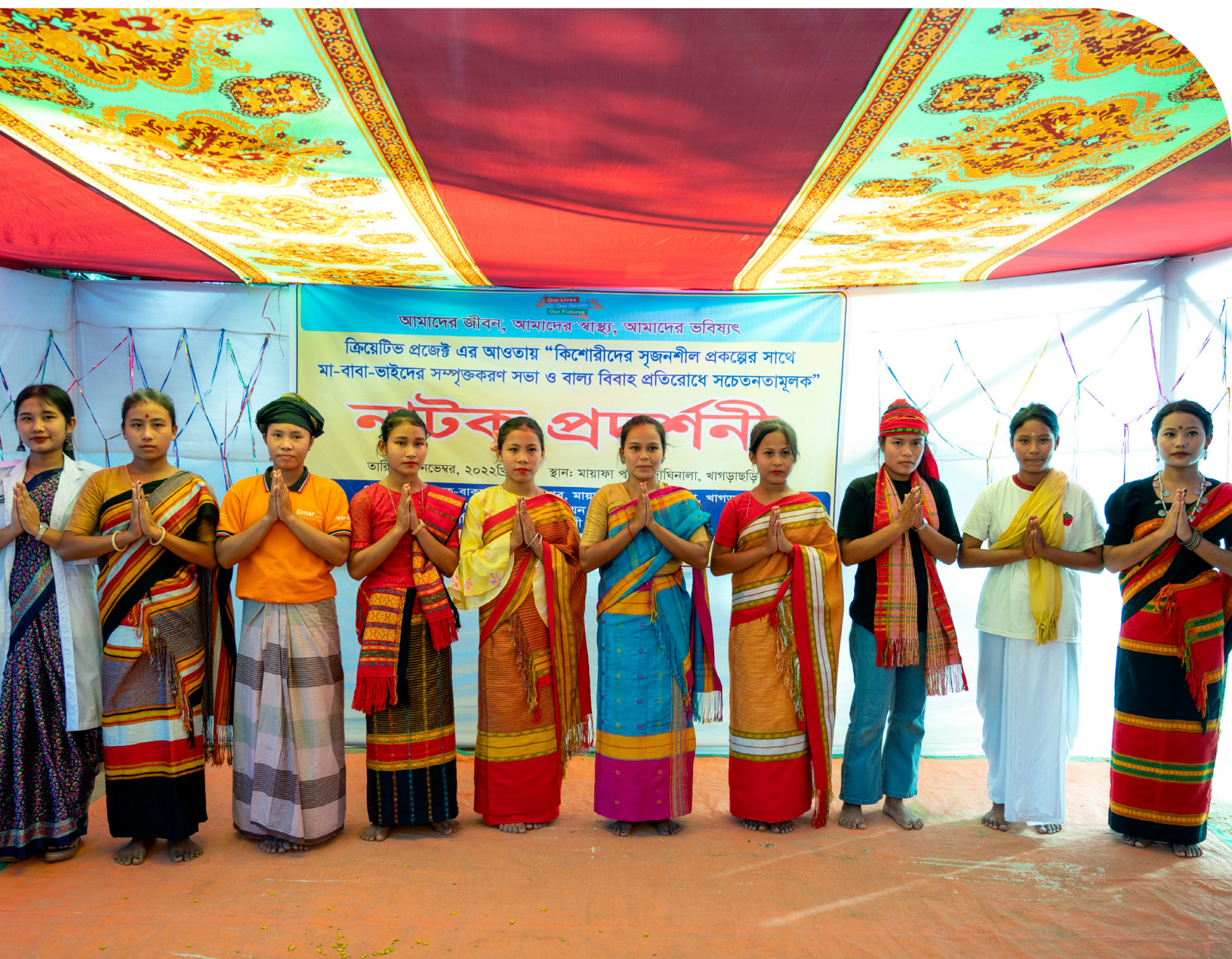
The adolescent girls from Kokbaksha Girls Club, Khagrachari during the end of their performance

I am glad I was able to educate some people in my community through the play. I hope to share this knowledge with our friends and neighbours to prevent child marriage.