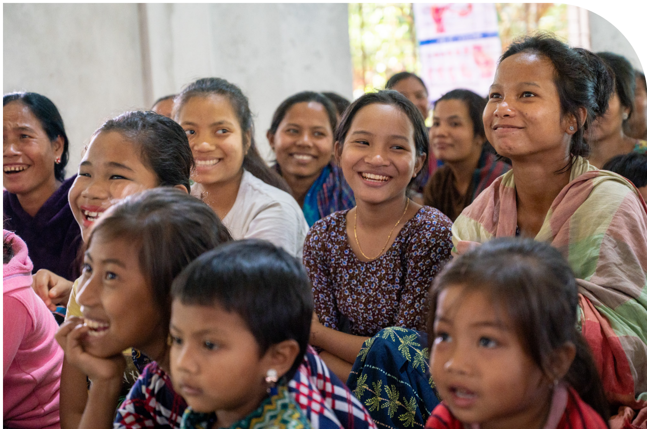
The audience watching the short drama on the negative impact of child marriage

Educating girls is more important than child marriage because when educated, a girl can study and support herself no matter what happens in her future. We made it a point to inform parents that they should prioritise their child’s education. I am proud of the project’s outcome and hope this conversation continues in the future.