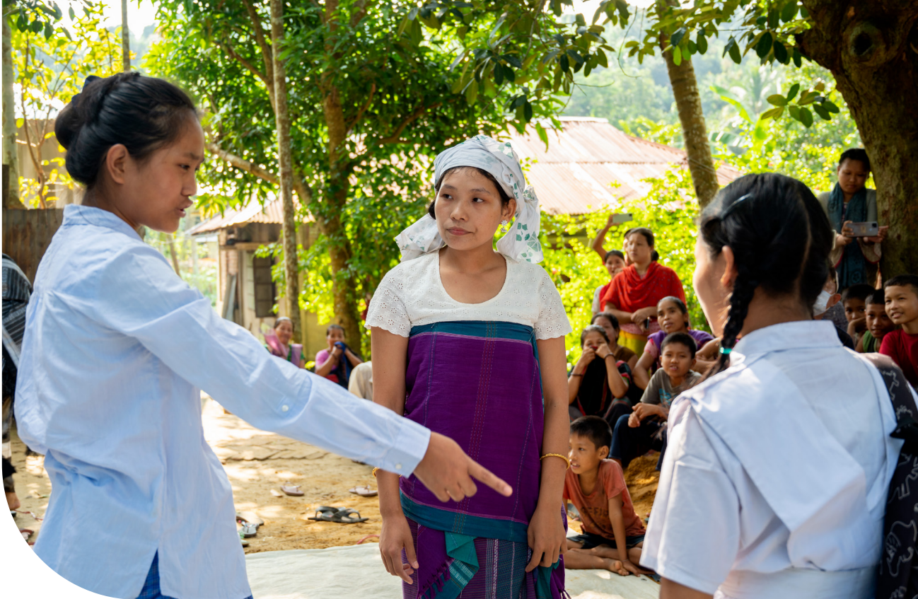
The adolescent girls portraying different characters in their street play on changing gender roles

While I have all these hopes and dreams, I find it difficult to get through my day because of the harassment I face. Commuting to and from college is a major issue in my area. Whenever I take public transport, boys sit uncomfortably close to me. Once, while I was out shopping, an old man approached me. He asked me for my WhatsApp number but I refused to give it to him.