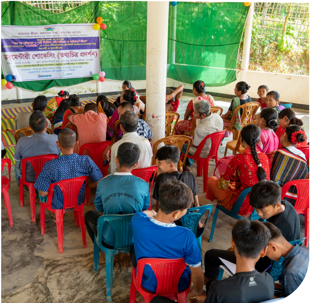
The audience at the poster presentation event organized by the girls of Moanghar Girls Club, Khagrachari

I enjoy wearing dresses but unfortunately, I get taunted on the streets when I do. I would love to go to the bazaar wearing the dresses I like but I end up feeling terrible because the boys there always tease me.