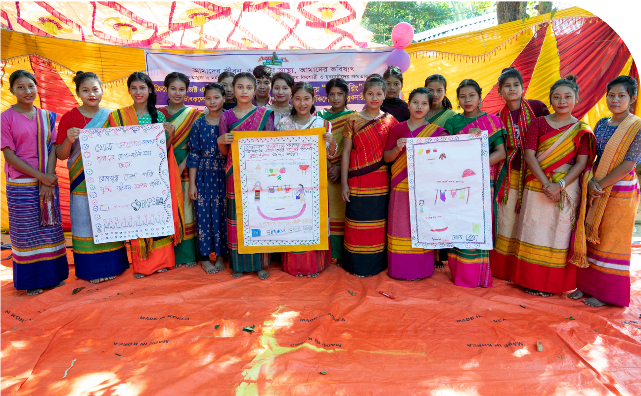
The members of the Montripara Girls Club, Khagrachari showing their poster presentation on menstrual health management

After I got my first period, I lost the freedom I had as a child. Whenever I go out, people always ask questions about where I am going, with whom, and for what. If I get home late, my neighbours gossip about it.