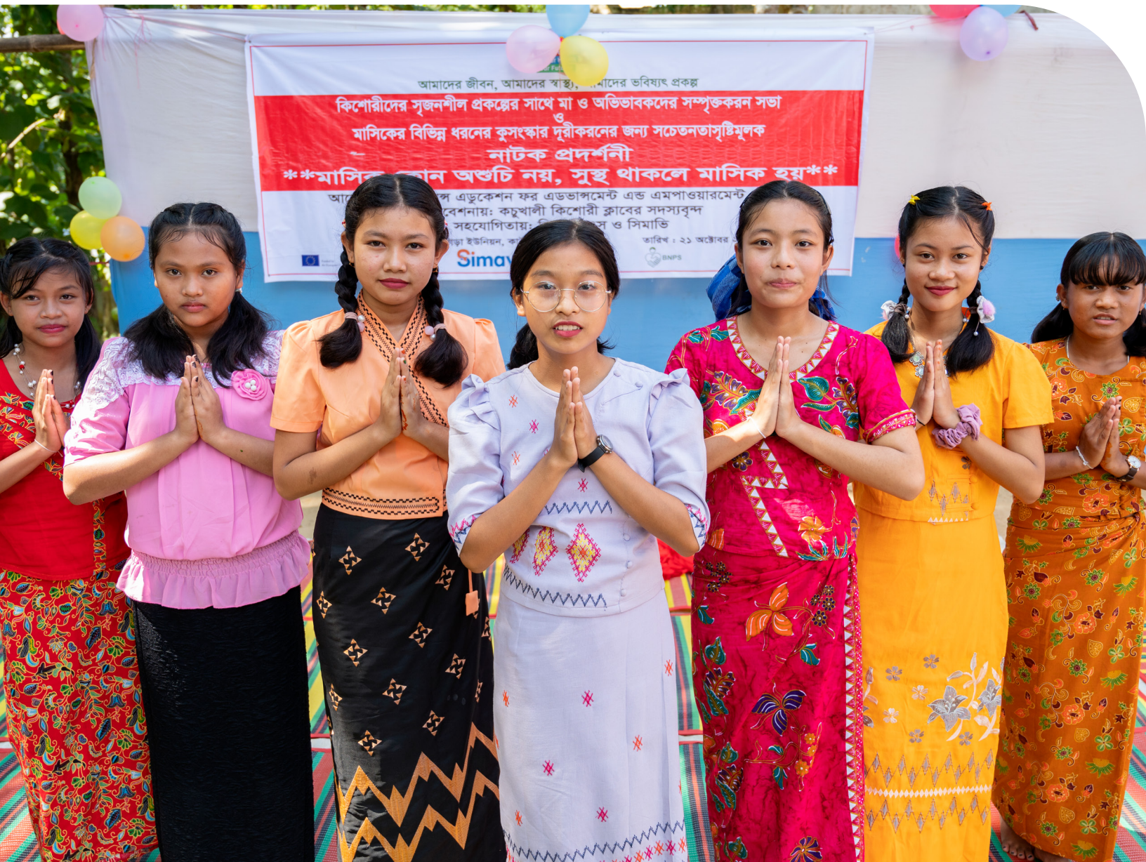
The girls from Kachukhali girls club after the performance

I hope that more people understand that menstruation is normal and that we must be understanding toward those experiencing it.